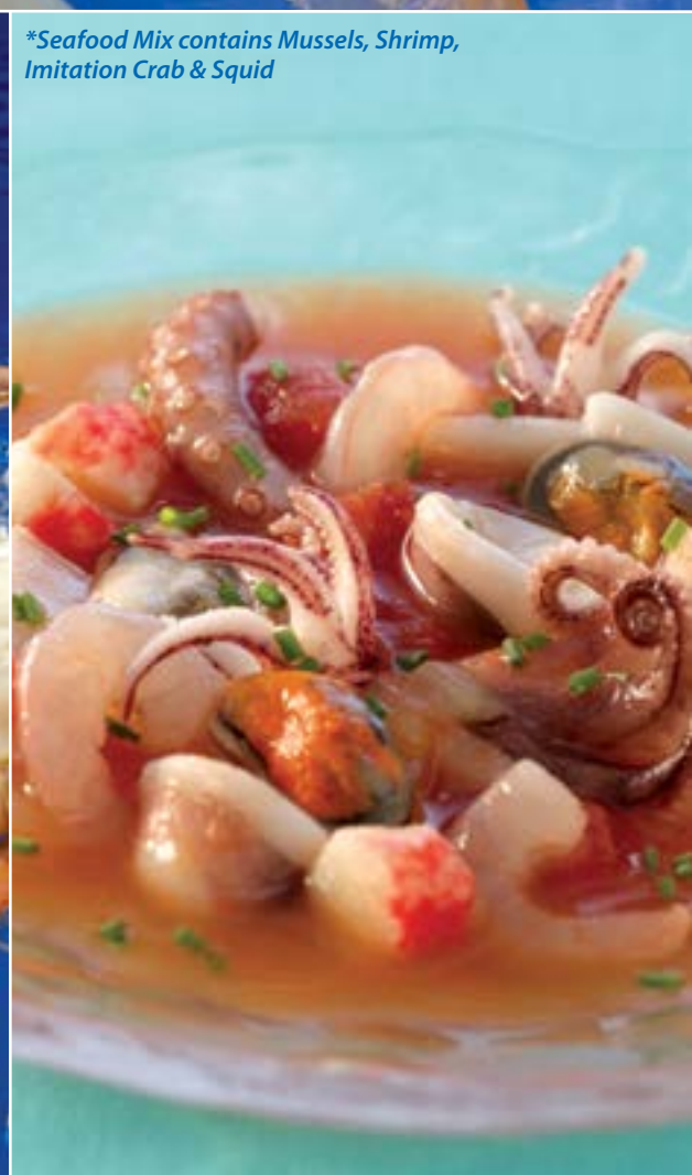
*Seafood Mix contains Mussels, Shrimp, Imitation Crab & Squid