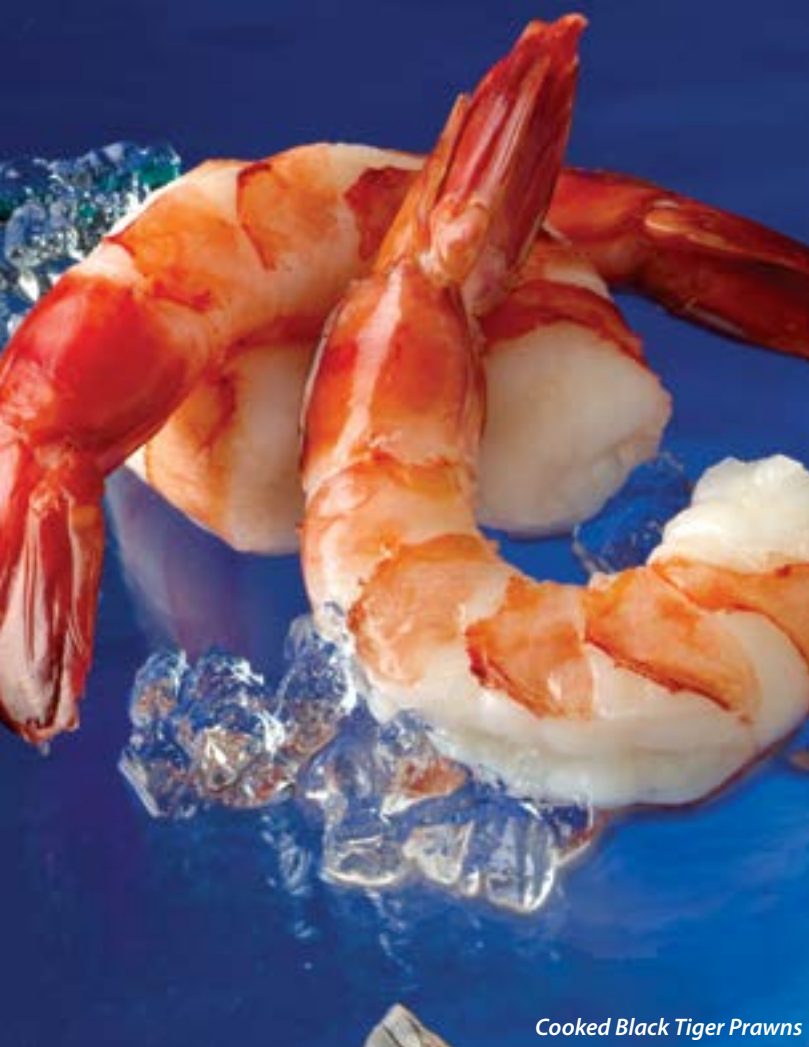
Cooked Black Tiger Prawns