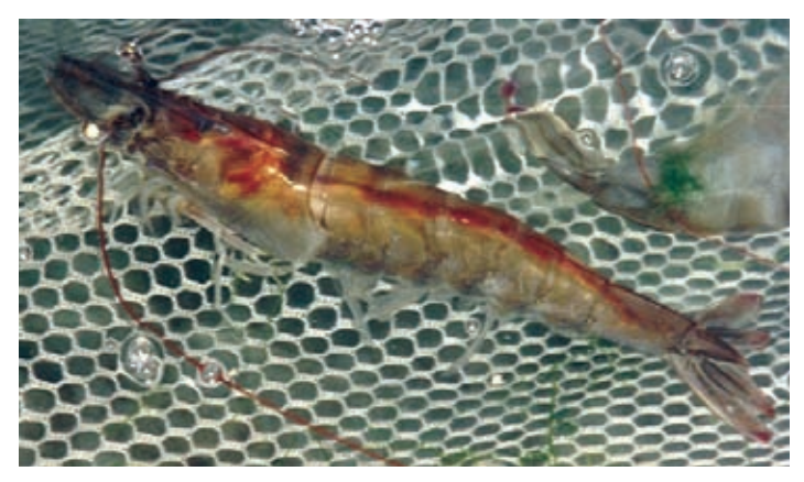
Specially bred broodstock have largely replaced wild animals as sources for quality postlarvae.

tiated a breeding program to develop fast-growing, TSVresistant P. vannamei in 1997. To date, 10 generations of selection have been completed.