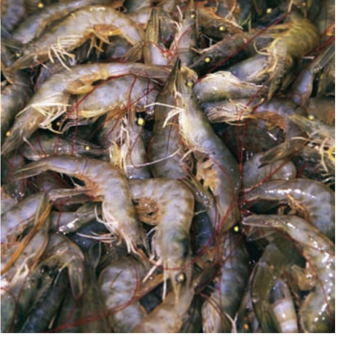
The traits of fast growth and disease resistance have established domesticated white shrimp as the world's top cultured shrimp species.

The main obstacle to growth was widespread shrimp disease that moved through the industry with the hatchery-produced PL, because the hatcheries paid little atten-